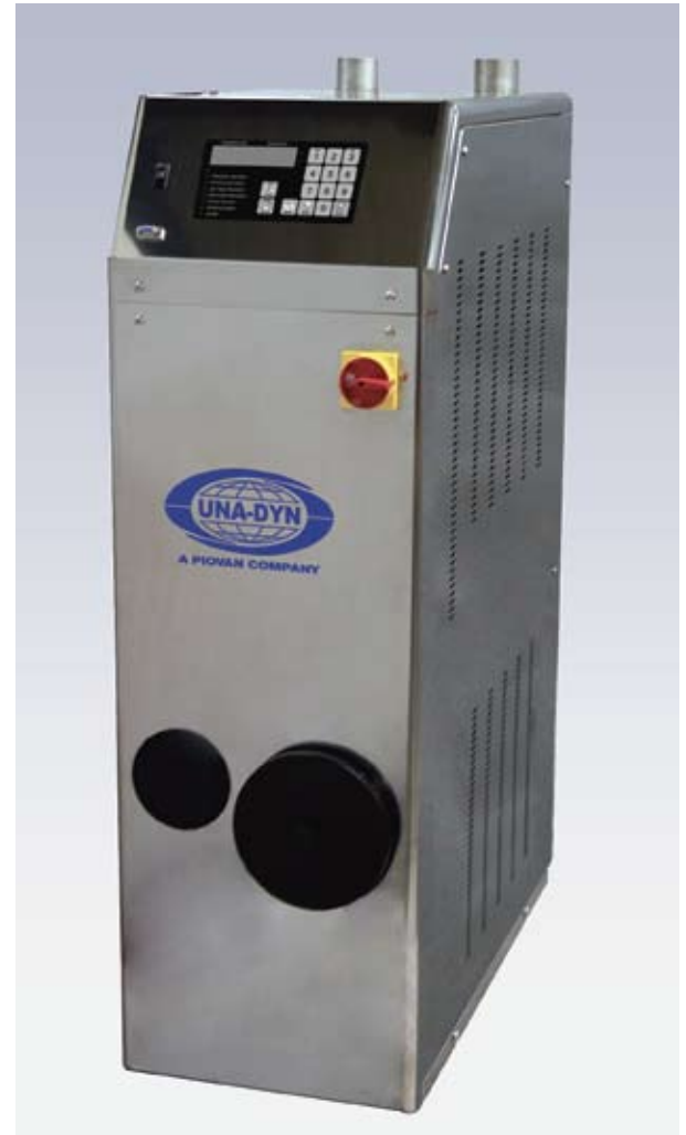
TR SERIES Rotary Wheel Dryer

In addition to a low power wheel drive, the TR SERIES features an advanced Heat Recovery and Filtration System . Ideal for the most stringent and demanding applications, such as clean rooms, medical and optical applications, these features ensure optimal energy consumption and protect the wheel by eliminating virtually all dust.